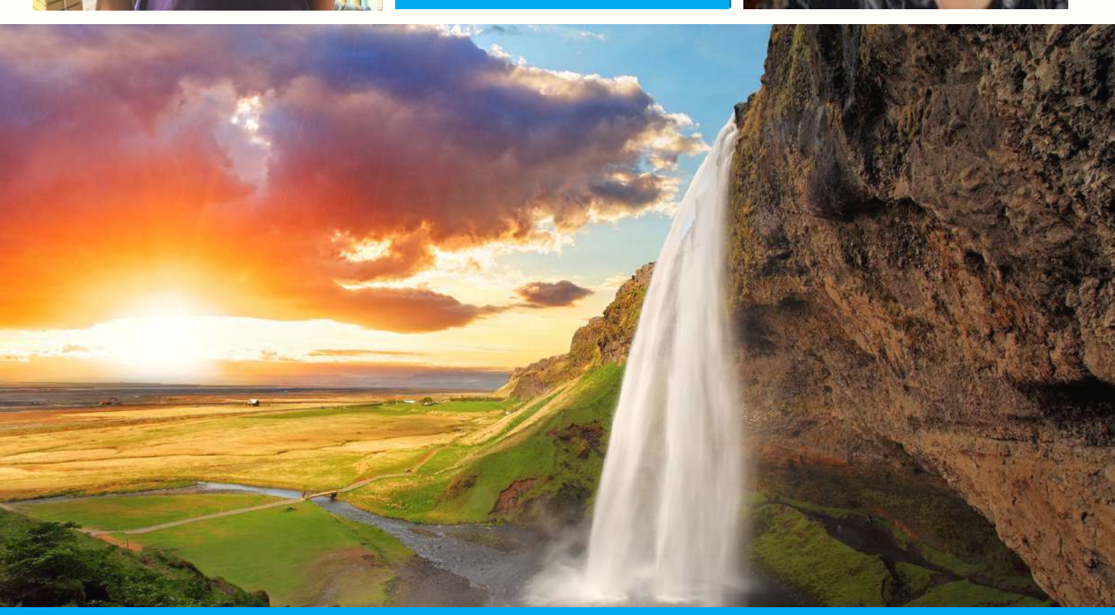
Play Iceland 2017